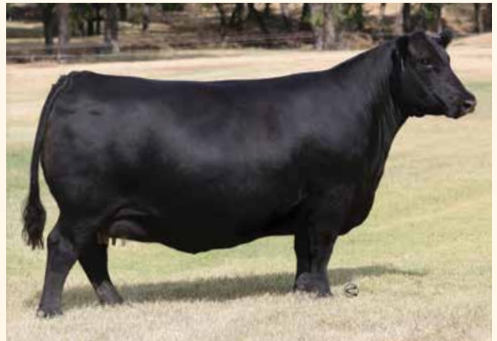
CONLEY DANDY 7350 • Dam of Lots 29 & 30