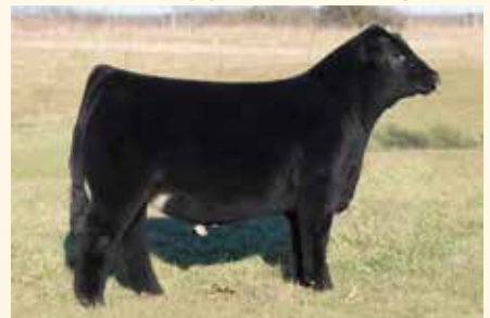
RATLIFF JUMP START 340J ET