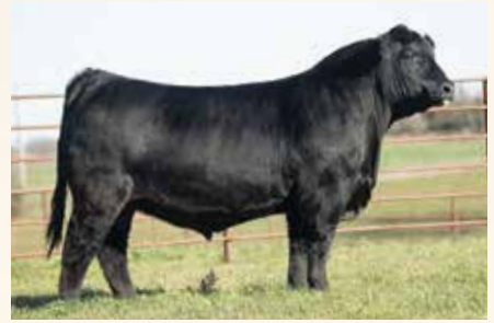
CELL-TNGC HITS THE MARK 2055H