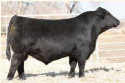
MAGS HARD CORE 1623H ET