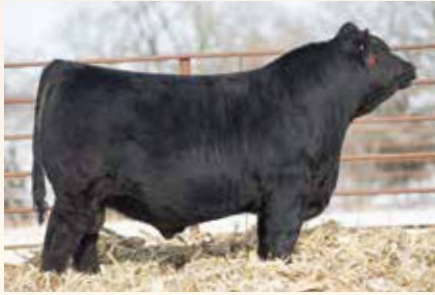
CELL HEAVY HITTER 0011H