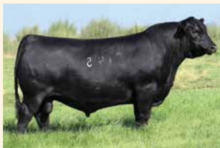
COLEMAN TRIUMPH 9145