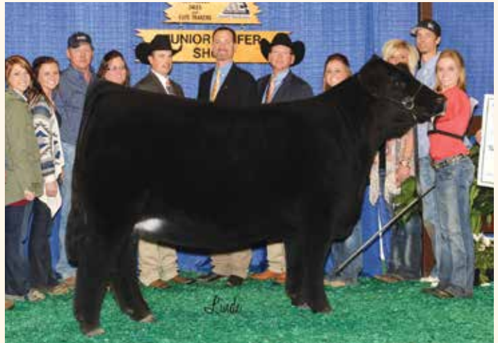
RIVERSTONE CHARMED • Dam of Lot 1