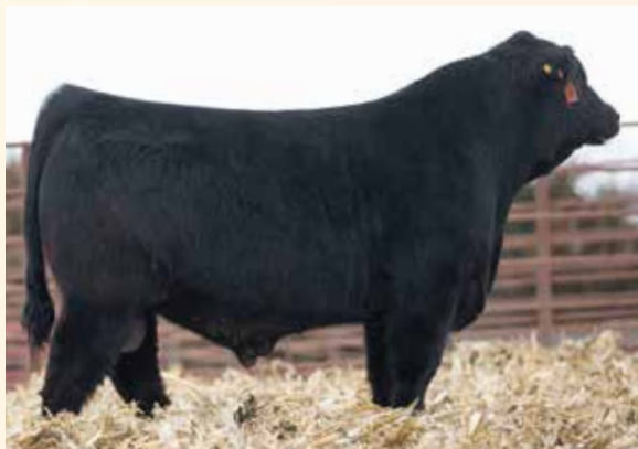
CELL HISTORY BUFF 0245H • Full sib to Lot 6