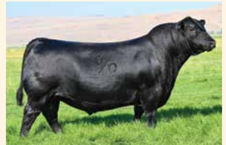
COLEMAN GLACIER 04I