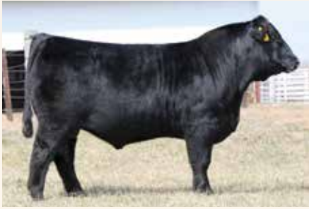
CELL ENVISION 7023E