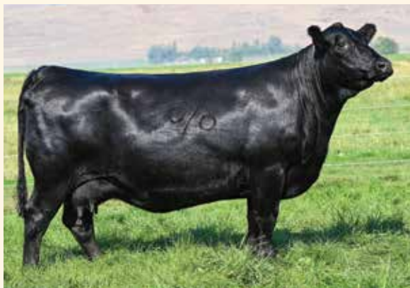
COLEMAN CHLOE 975 • Dam of Lots 22 & 23