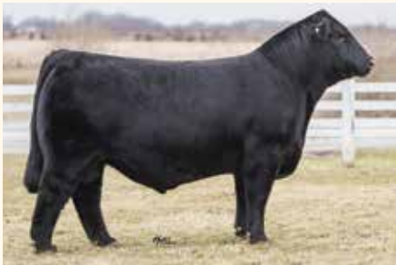
FWLY CAN DO