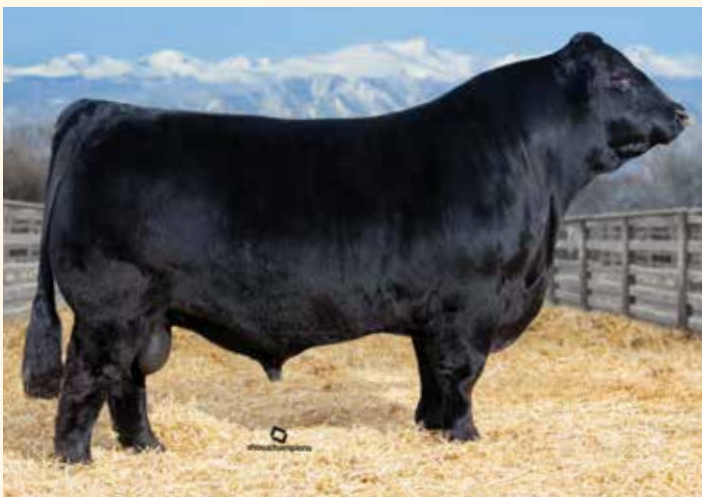
ELCX KINGS LANDING 599 D ET • Sire of Lots 2A & 2B