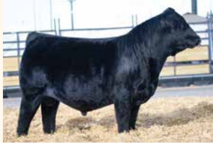
ELCX HIGH TIME 065H ET