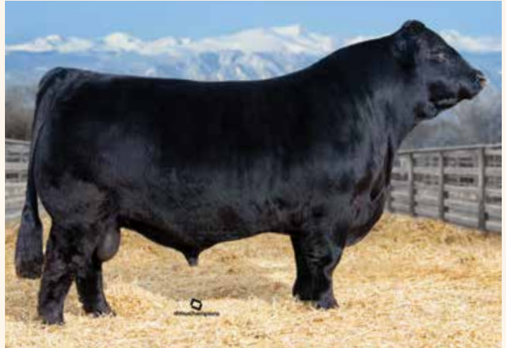
ELCX KINGS LANDING 599 D ET • Sire of Lot 1