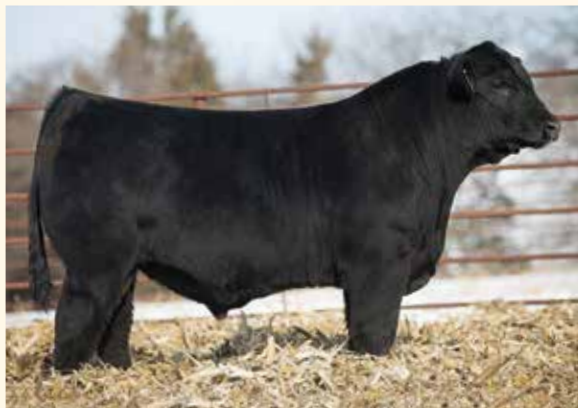
CELL HISTORY MAKER 0256H • Full sib to Lot 6