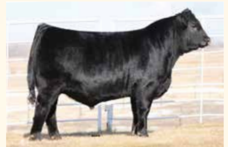
MAGS FEDERAL RESERVE ET