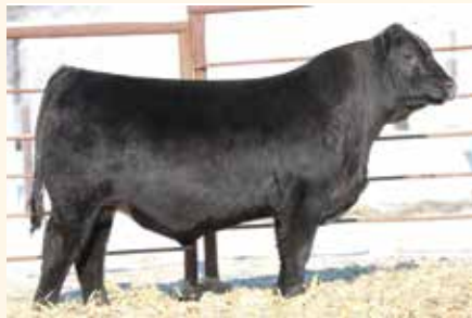
LVLS FULL DUTY 2201F