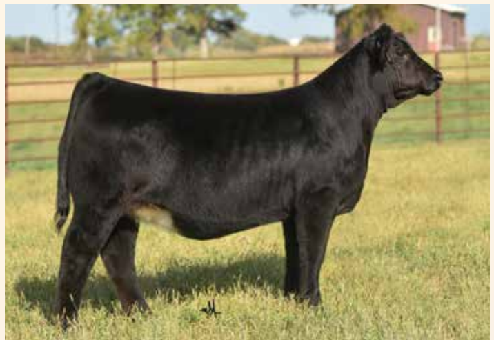
CELL MARGOT 4004M