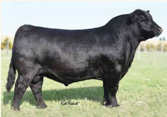
KR CASINO 6243 • Sire of Lots 29 & 30