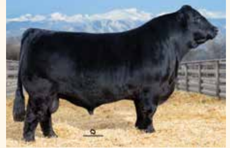
ELCX KINGS LANDING 599 D ET