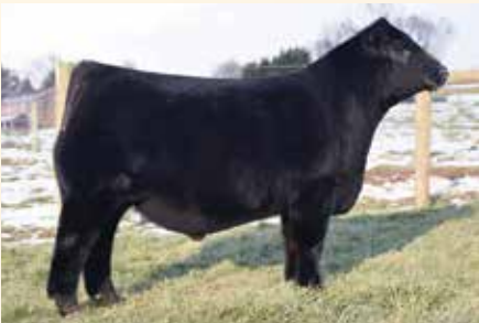
TASF HEINEKEN 405H ET