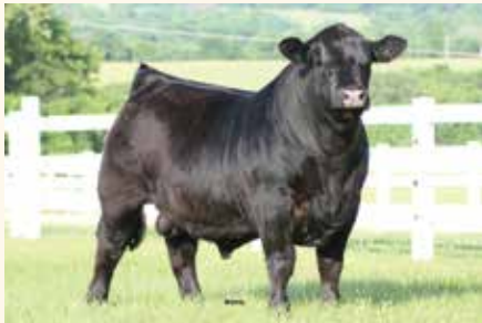
FWLY LHC CAPITAL ET