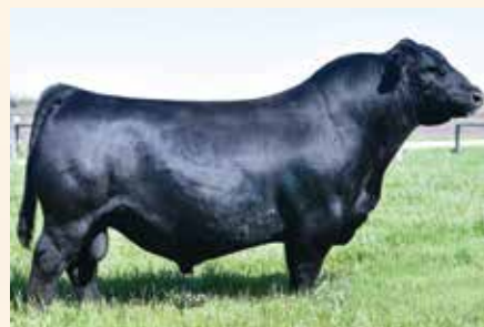
PVF BLACKLIST 7077