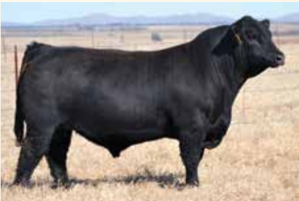
LFL GAMER 9116G ET