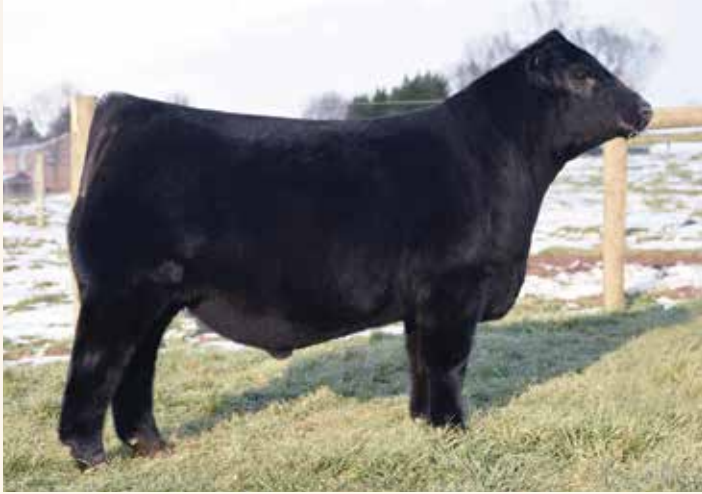
TASF HEINEKEN 405H ET • Sire of Lots 60 & 62