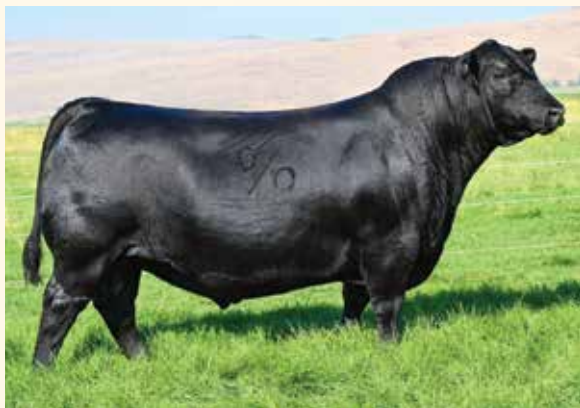
COLEMAN GLACIER 041 • Sire of Lots 22 & 23