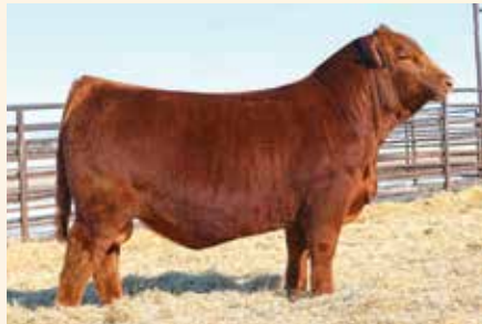
WULFS KUT ABOVE 7118K