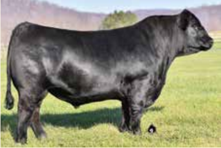
COLE GENESIS 86G