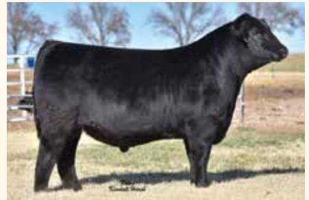
LFL FERRARI 8143 F