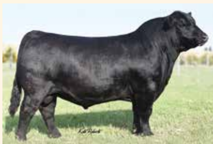
KR CASINO 6243