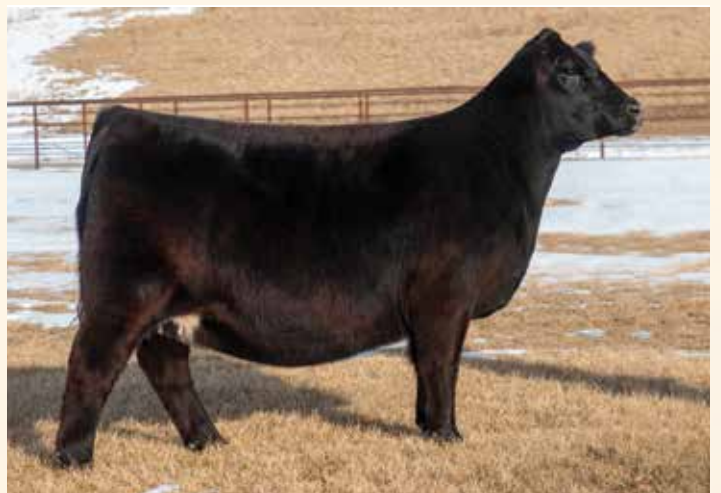
CELL FASCINATION 8231F ET • Dam of Lots 2A & 2B